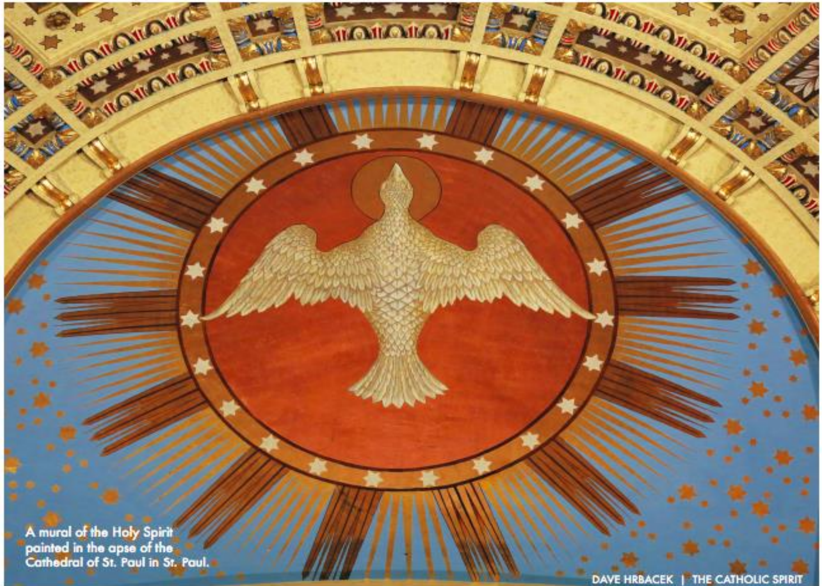
A mural of the Holy Spirit painted in the apse of the Cathedral of St. Paul in St. Paul.